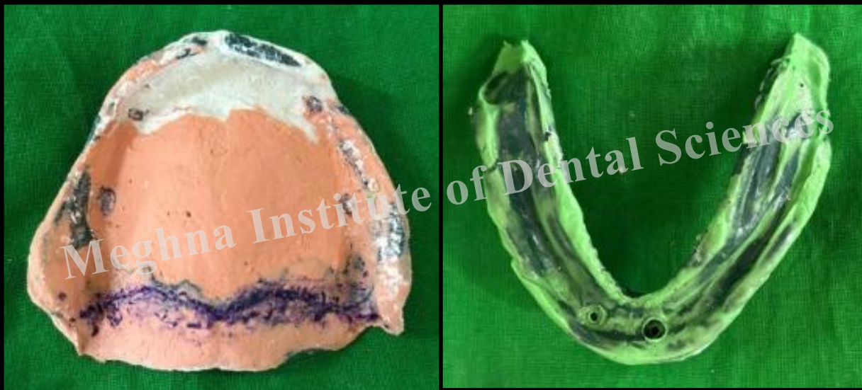
Border Moulding & Secondary Impression