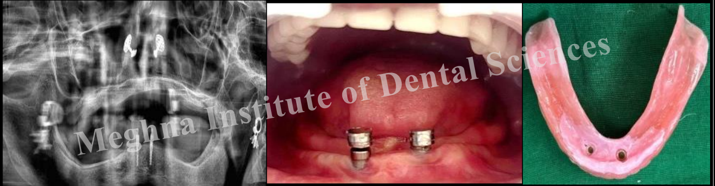
Precisions Attached To Ball Attachments