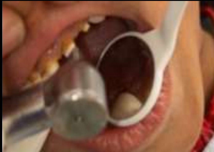
TOOTH PREPARATION IRT 51,52,61,62