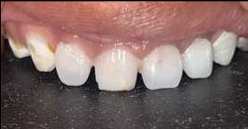
POST-OP FRONTAL VIEW AFTER PLACING EDELWEISS CROWNS IRT 51,52,61,62