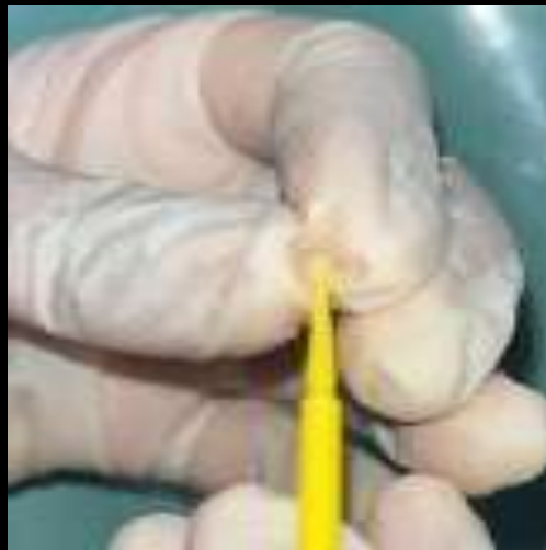
BONDING THE CROWN WITH VENEER BOND