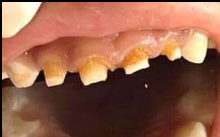
TOOTH PREPARATION DONE