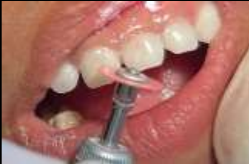
POLISHING THE CROWNS AFTER PLACEMENT