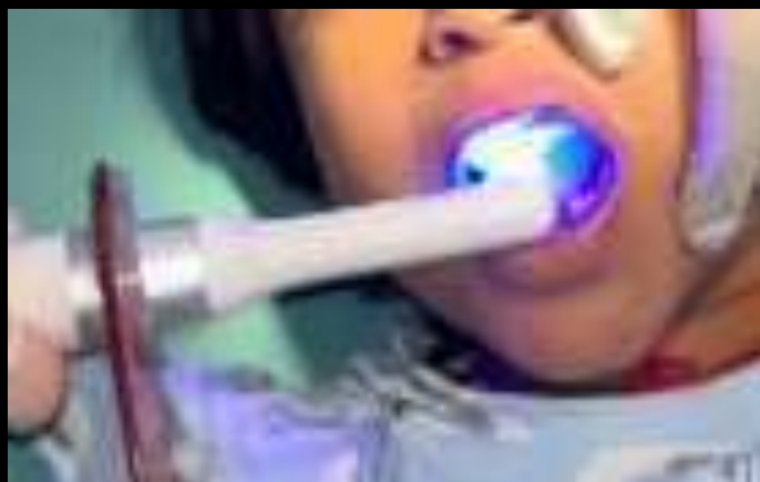
CURING AFTER CROWN PLACEMENT