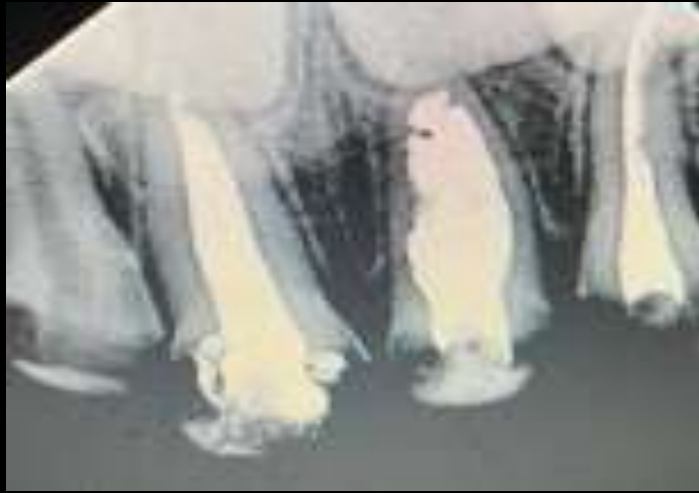
PULPECTOMY DONE IRT 51,61,62