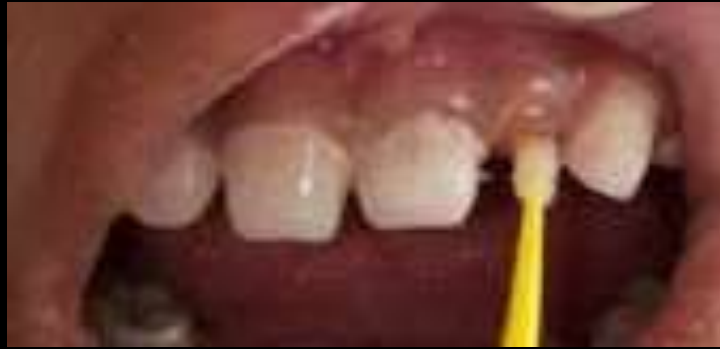
ETCHING AND BONDING TOOTH SURFACE