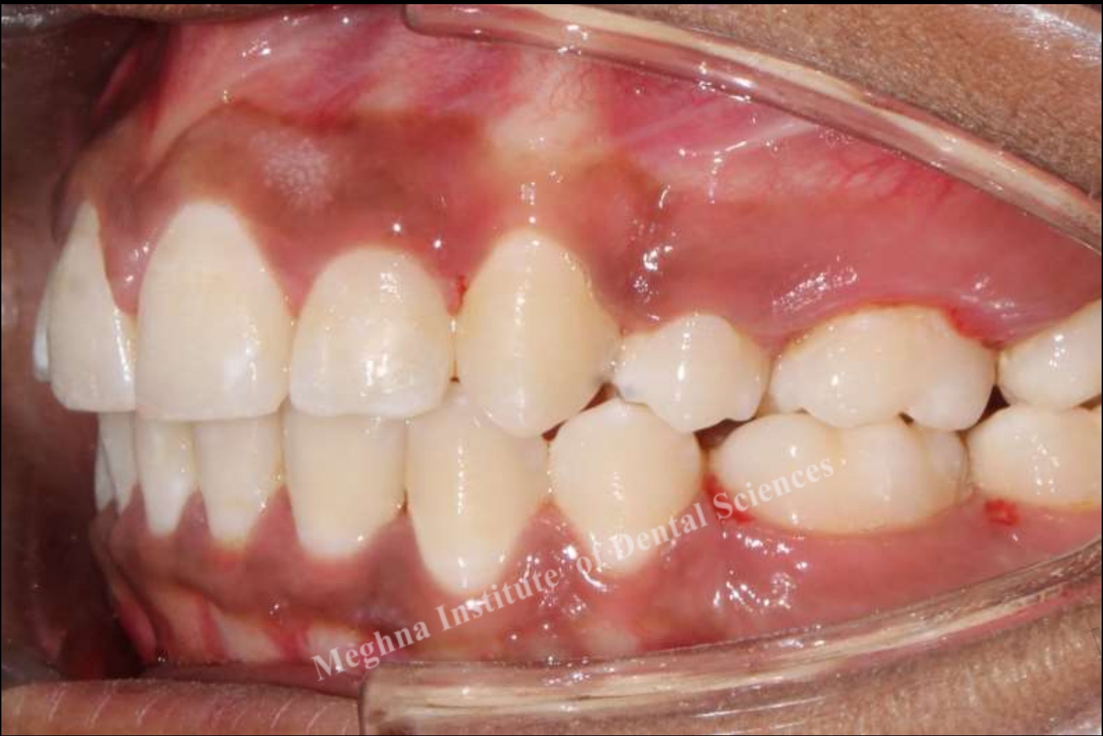
Post treatment intraoral left buccal photograph