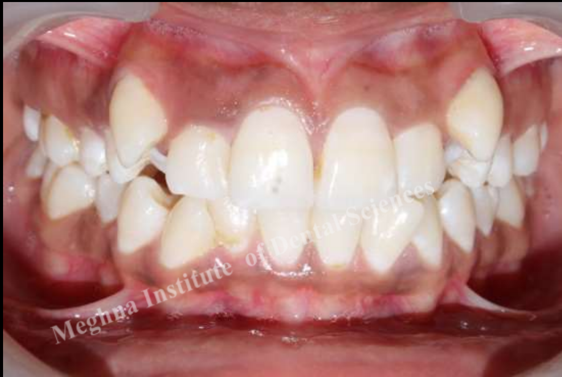
Pre treatment introral frontal photograph