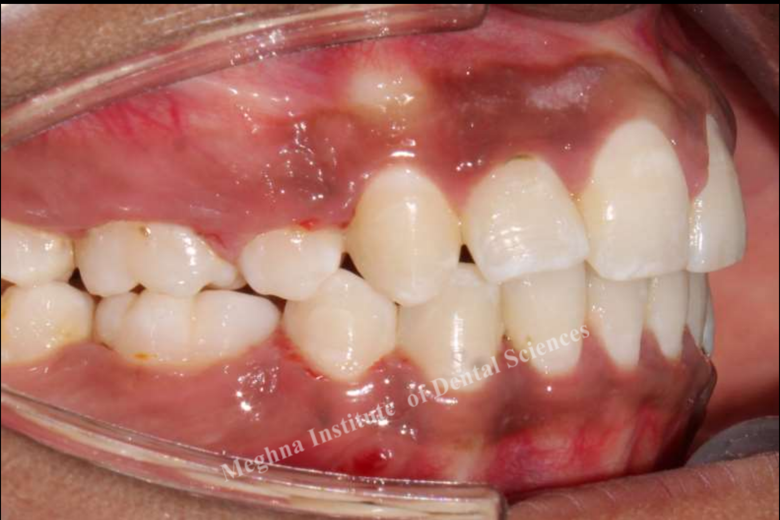
Post treatment intraoral right buccal photograph