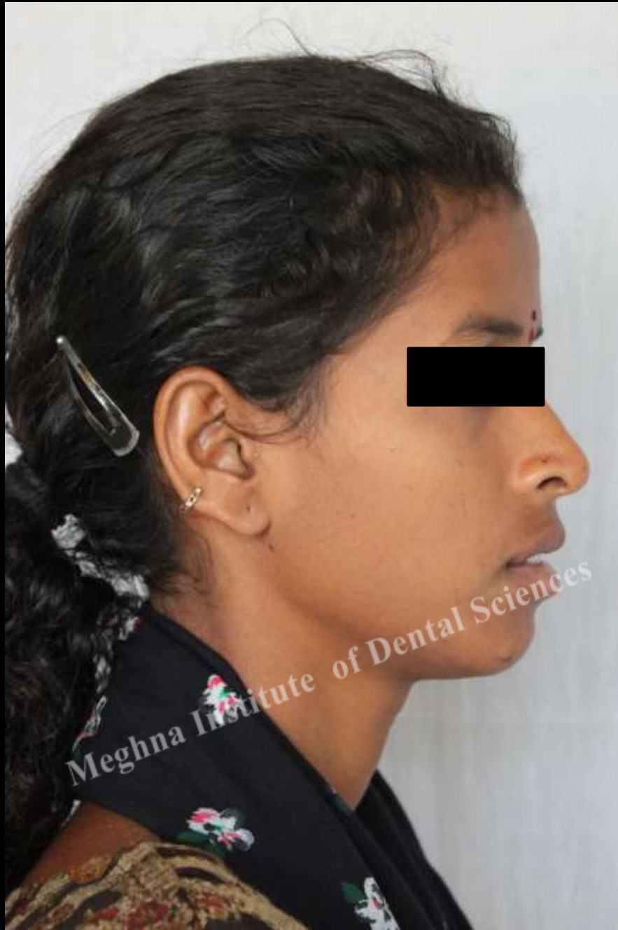
Pre treatment profile photograph