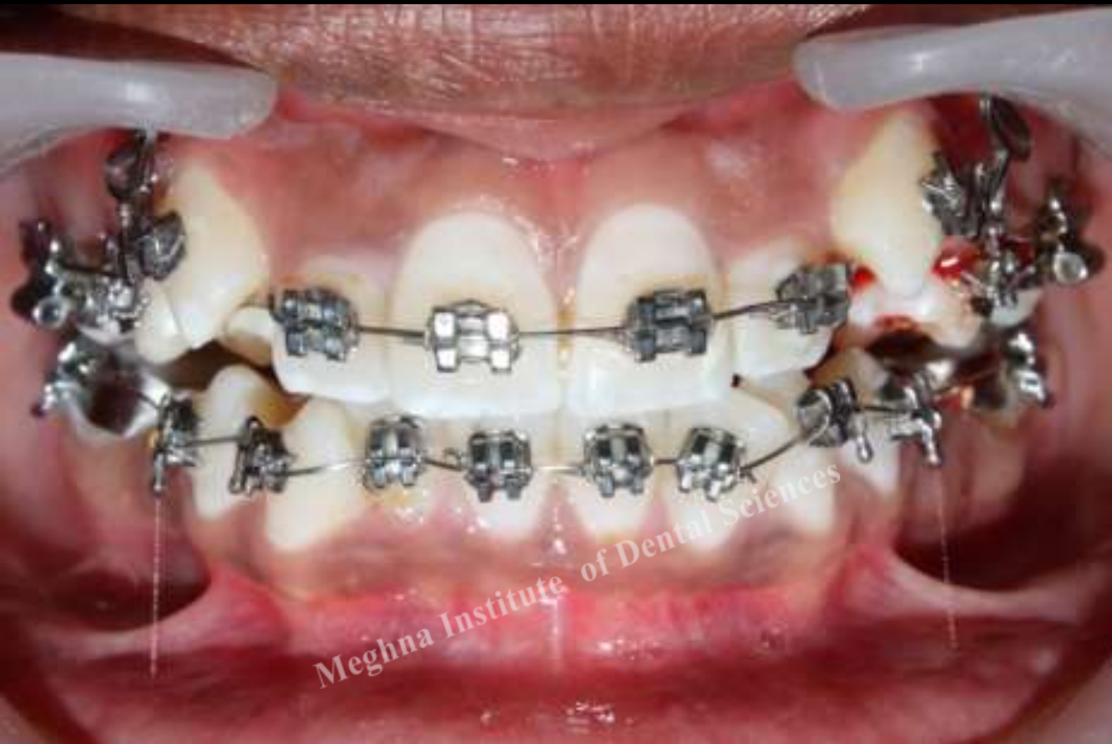
Individual canine retraction with T loop intraoral frontal photograph