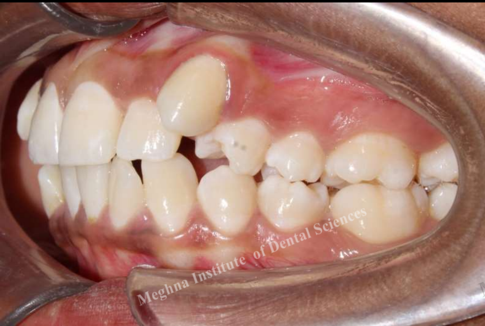
Pre treatment intraoral left buccal photograph