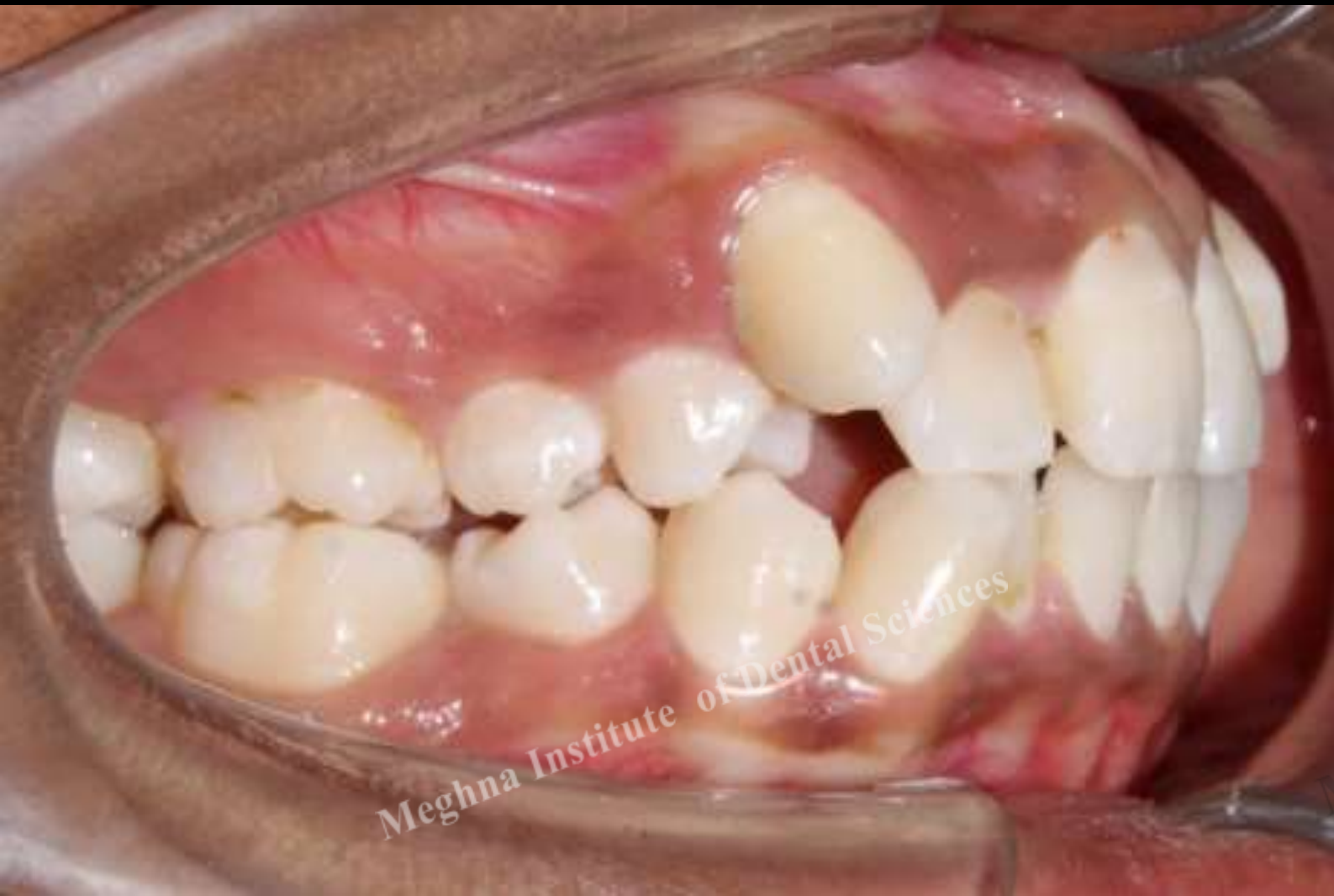
Pre treatment intraoral right buccal photograph