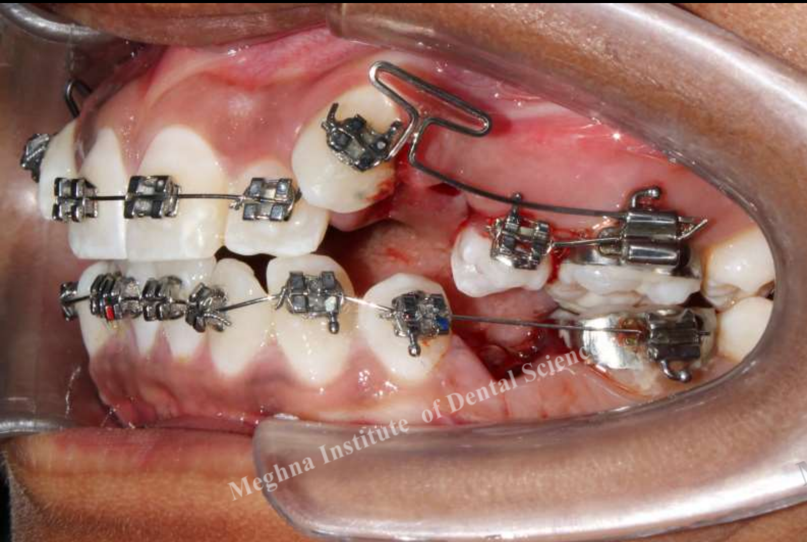
Individual canine retraction with T loop intraoral left buccal photograph