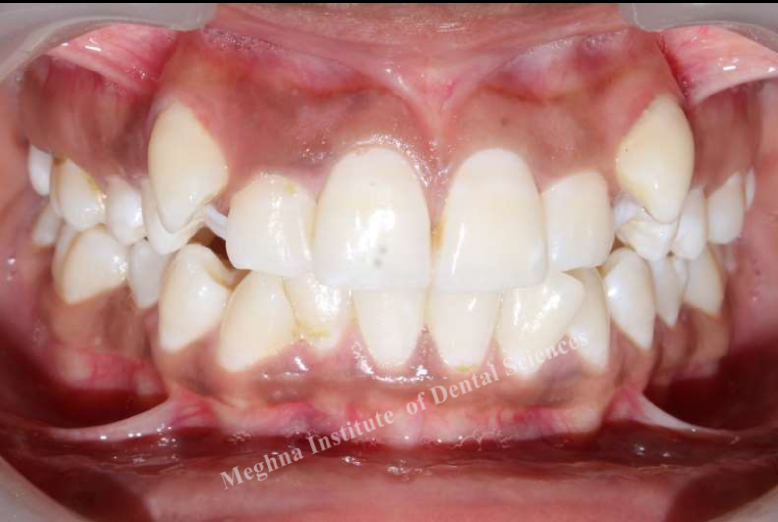
Pre treatment intraoral frontal photograph