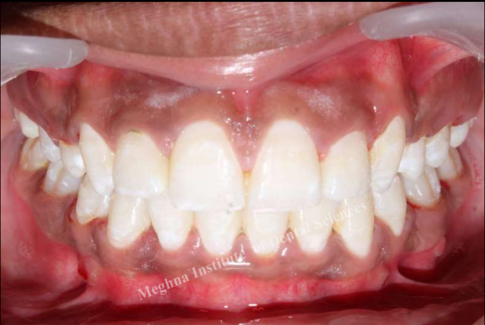
Post treatment intraoral frontal photograph