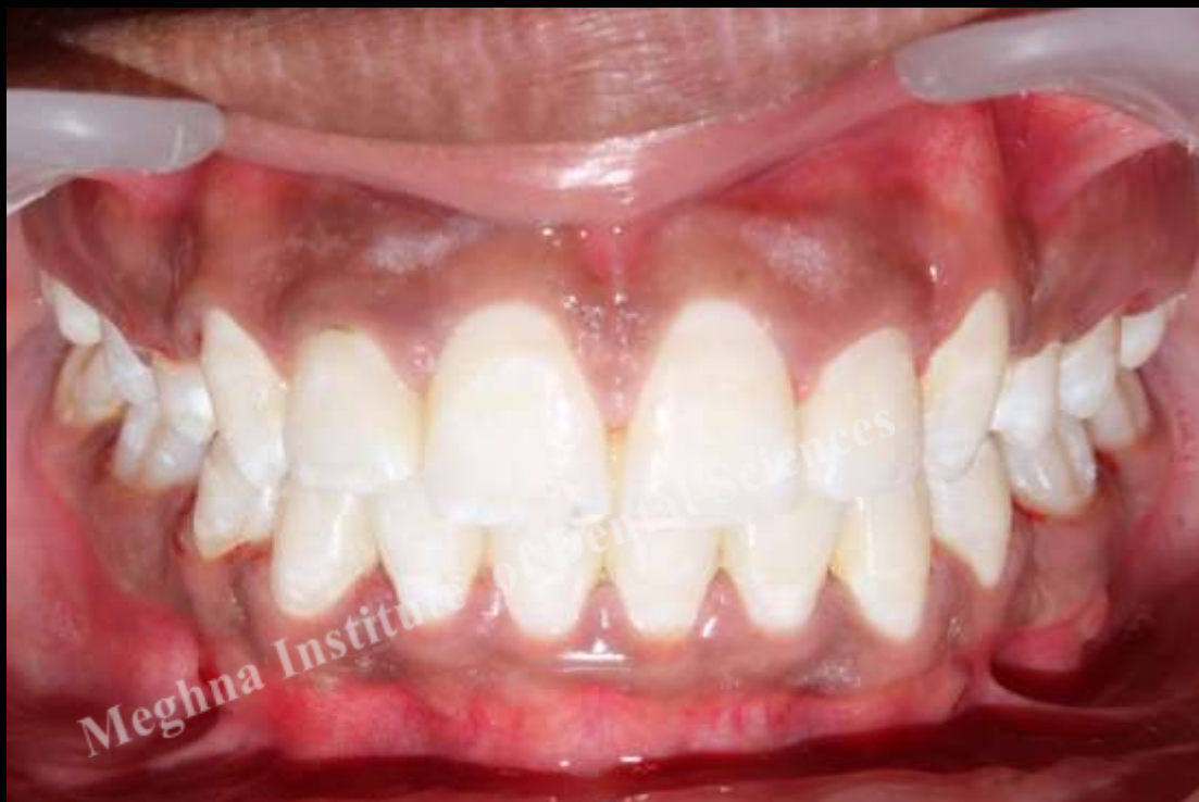
Post treatment intraoral frontal photograph